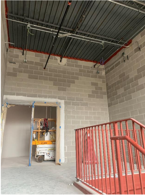
16. Area 3 – Work on second floor gradewalling entry feature continues. Painting has begun.